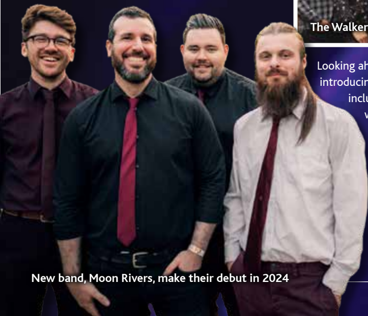
New band, Moon Rivers, make their debut in 2024

Ahead of all that, The Cornish Bakery have organised a Quiz night on Friday, 24th November to raise funds for the Mind Charity - look out for a novel 'food tasting' round - remember to pre-book your team!