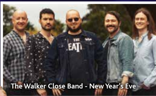
The Walker Close Band - New Year's Eve