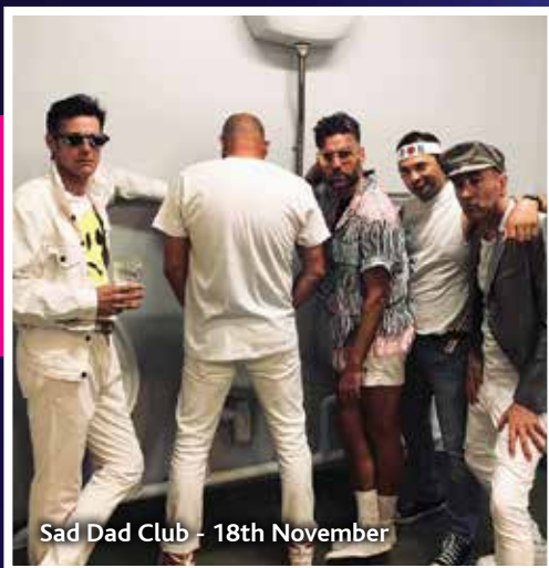
Sad Dad Club - 18th November