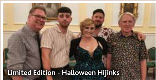
Limited Edition - Halloween Hijinks

Summer has seen some extremely well-attended fundraising events - both the Quiz and Bingo Night from Luckington Carnival Club saw the club full and tickets for the charity fundraiser in aid of Mind quickly sold out. As always, Mardons would like to thank everyone for their generosity and support.