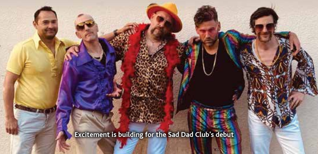
Excitement is building for the Sad Dad Club's debut