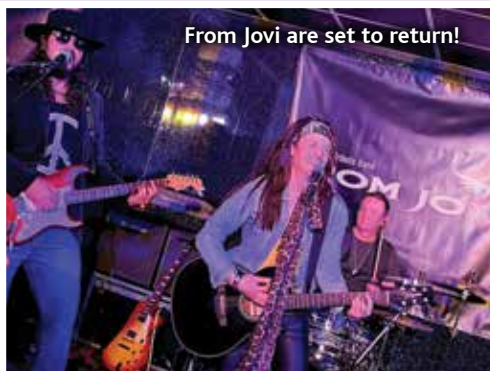
From Jovi are set to return!

The Sad Dad Club are a relatively new band that are making a big impact and garnering a very loyal and growing fan base. Their performances are lively, fun and crowd pleasing, so should certainly appeal to the audience at Mardons.