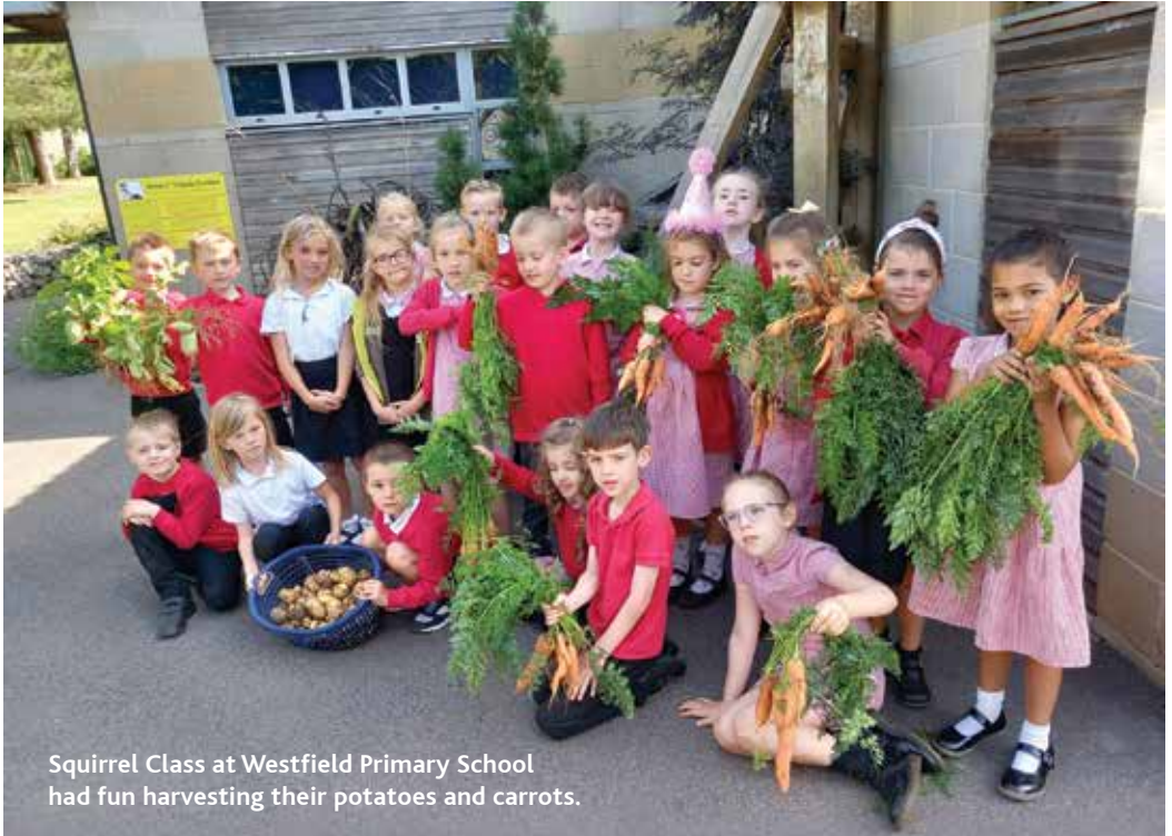
Squirrel Class at Westfield Primary School had fun harvesting their potatoes and carrots.