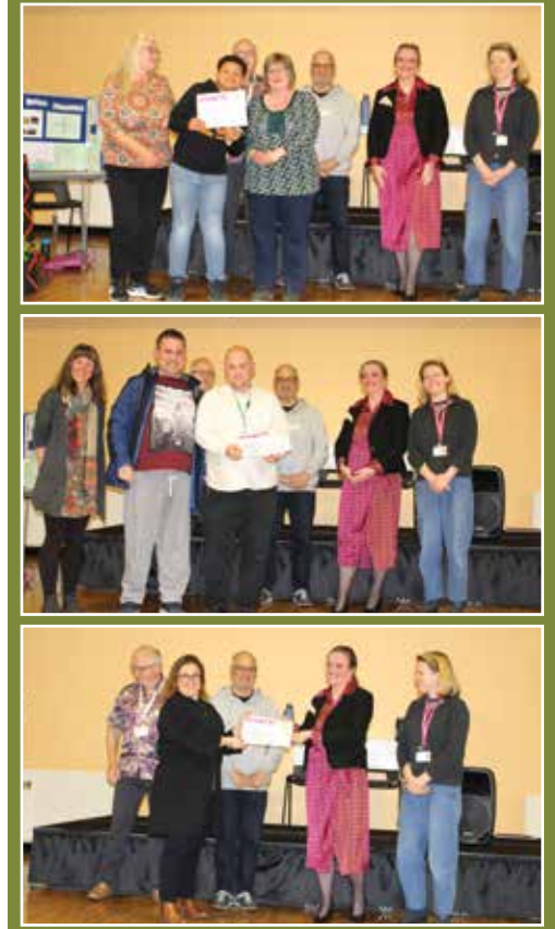
Successful applicants, Larch Court Allotments, Swallow charity and Fosseway School.

Fosseway School – to create a more inclusive and safer playground which will be available for