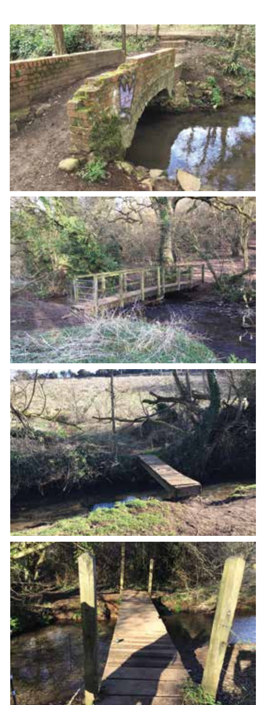
Bridges at Waterside Valley in need of an upgrade