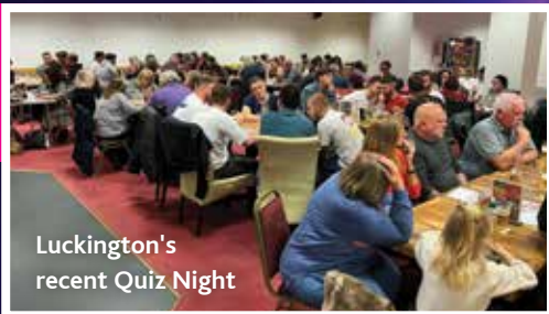
Luckington's recent Quiz Night

Call The Shots will perform at the Club's Christmas Party on Saturday, 17th, and as an added bonus, Outatime will turn back the clocks on Friday, 23rd December to deliver an 80s Tribute Night.