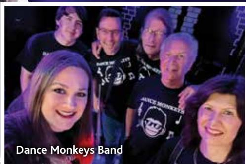
Dance Monkeys Band

Looking ahead to the New Year, Mardons will be introducing several new bands, so go along to give them a warm welcome. Rescheduled from earlier this year, the highly anticipated Snappa will be treating visitors to their impressive pop/rock performance. Both Dance Monkeys, a great new party band and a special Bon Jovi tribute night with From Jovi are also lined up for January, entry is free and all are welcome.