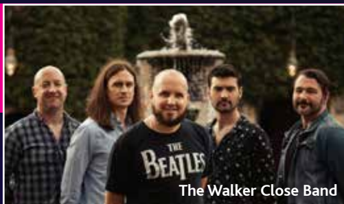
The Walker Close Band