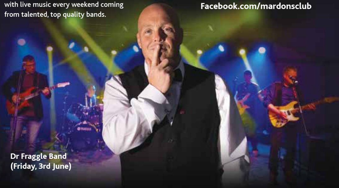
Dr Fraggles Band (Friday, 3rd June)