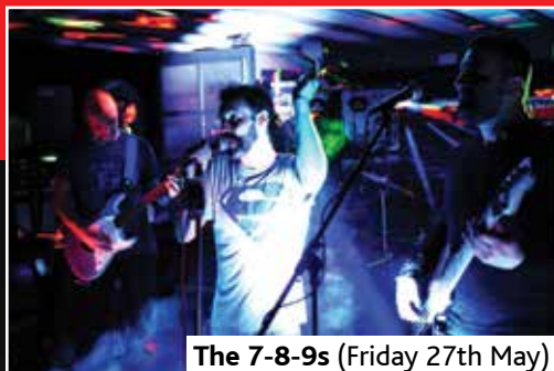
The 7-8-9s (Friday 27th May)

The regular entertainment continues at a pace, with live music every weekend coming from talented, top quality bands.