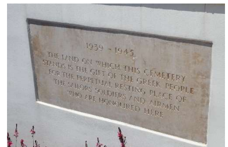
Allied War Cemetery, Souda Bay, Crete

I was so overwhelmed to see a Spitfire carry out a flypast, which just broke me as my Mum worked at the factory in Feltham, Middlesex which was building them.