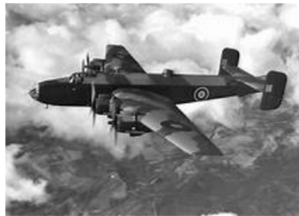
Handley Page Halifax

Two more graves piqued my interest, two RAF Sergeants, who both died on the same day. Again, my friend Google came into play and provided a bit of a mystery. The two Sergeants were part of the crew of a Mark V, Handley Page Halifax, (DG408).