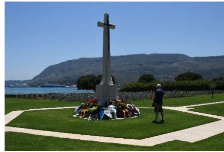
Allied War Cemetery, Souda Bay, Crete