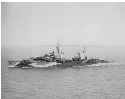
Charybdis underway, February 1943

In a stunning rose garden in Howard Davis Park were a group of wooden crosses, mostly of unknown Royal Naval sailors who all died on the same day. With a little computer work, I found they were crew members of HMS Charybdis, a Dido Class Light Cruiser.