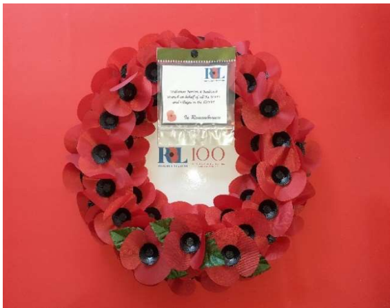
Example of a typical wreath with badge.